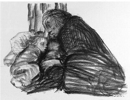
City Shelter, Kathe Kollwitz, 1926, public domain

The observances of Tish'a B'Av —not wearing fresh clothes, not washing, fasting from eating and drinking and sexual contact, not greeting each other, not sitting anywhere except on the ground-are closer to the experience of being a refugee than to being a mourner. The destruction of the Temple stands not just for the destruction of Jerusalem, but for the city being turned into a war zone, and the people becoming prey to hunger, violence, and death. Tish'a B'Av is not primarily about the Temple - Chaza"l, the rabbis, figured out how to live without the Temple long ago. Rather, Tish'a B'Av is about homelessness, fleeing from war into famine, being thrown into a hostile world without shelter or protection - things all too present in our world. It's an opportunity empathize, to confront the ways we abuse our power, as individuals, as a society, as a people, and as a species, turning other people and other species into refugees.